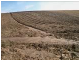
Organic matter decline